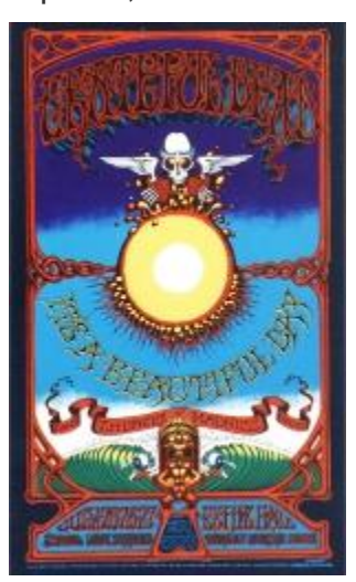
The Hawaiian AOXOMOXOA

Called the "Hawaiian AOXOMOXOA," this is a poster for a show that never took place. Rick Griffin hand carried 25 back from Hawaii himself on the plane. The printer destroyed all the other copies because he was never paid for the gig. Of the 25 that were salvaged, there were four printer's proofs, three on the same stock as the posters and one on a slightly different stock. These 25 were the only originals of this most classic poster. There have been two reprints, one that is smaller.